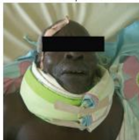
Figure 2 A patient with C3 laminar fractures and bifacet dislocation of C3/C4 has his cervical spine stabilized with a rolled-up bed sheet