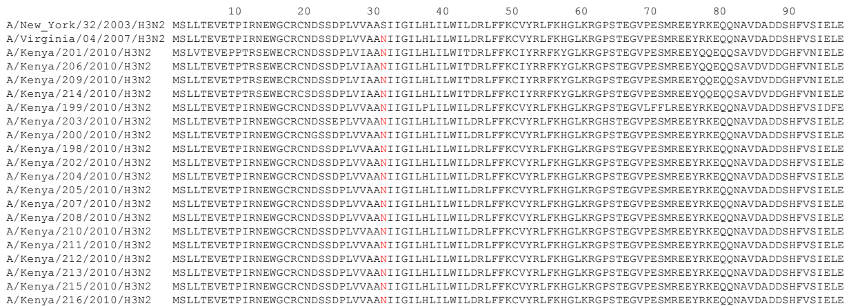
Figure 3: Multiple Sequence alignment of the M2 proteins of the Kenyan isolates alongside two reference strains of known sensitivity to adamantanes. A/NewYork/32/2003 is adamantane sensitive and A/Virginia/04/2007/H3N2 is adamantane resistant.

generated by reassortment between human and avian influenza viruses (Xu et al, 2004). Thus our results show that four of the 32 (11%) patients who were ill with influenza had the etiology of a reassortant influenza A(H3N2) virus whose M gene segment was derived from influenza A(H1N1)pdm09 viruses.